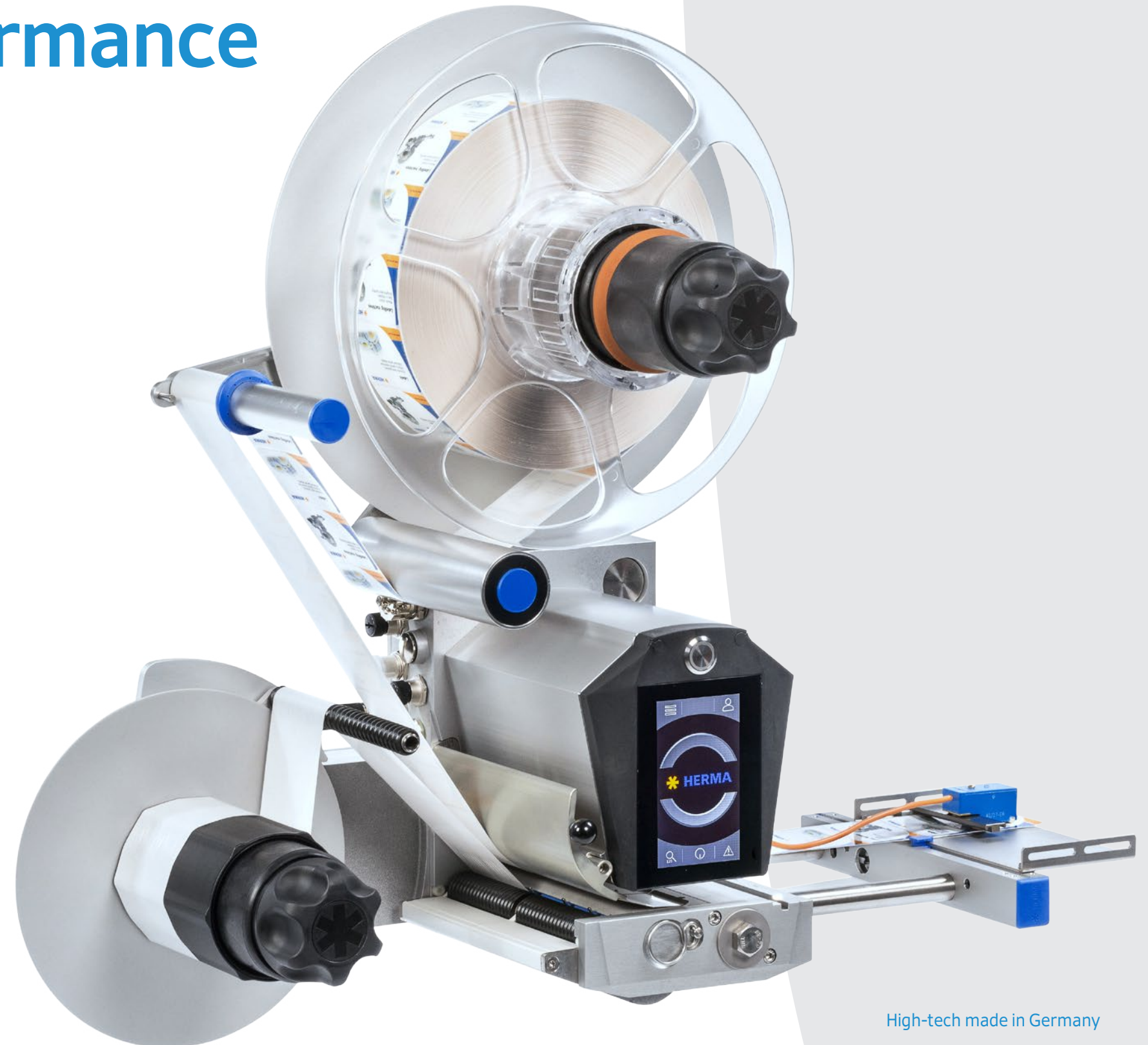
High-tech made in Germany

Quick set-up: Short make-ready time thanks to innovative technologies such as assisted backing paper feed & automatic label length detection.