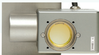
Compact i-Tech Scan head with flexible mount for head rotation in 90 degree steps

Our next generation of primary coders deploy our unique intelligent Technology system, i-Tech . Our aim was to make production lines lower maintenance, lower cost and more efficient. i-Tech has helped us to achieve that aim.