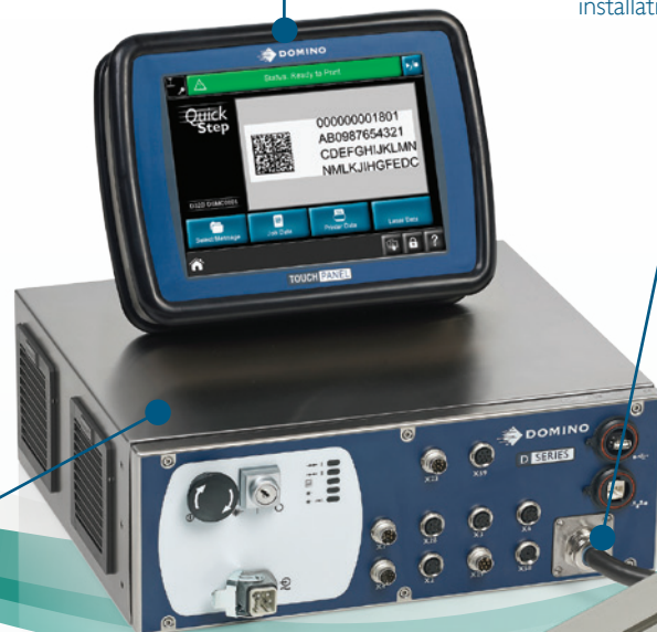
Industrial connectors and detachable conduit for easier installation and servicing