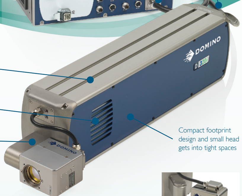
Compact footprint design and small head gets into tight spaces

Our next generation of primary coders deploy our unique intelligent Technology system, i-Tech . Our aim was to make production lines lower maintenance, lower cost and more efficient. i-Tech has helped us to achieve that aim.